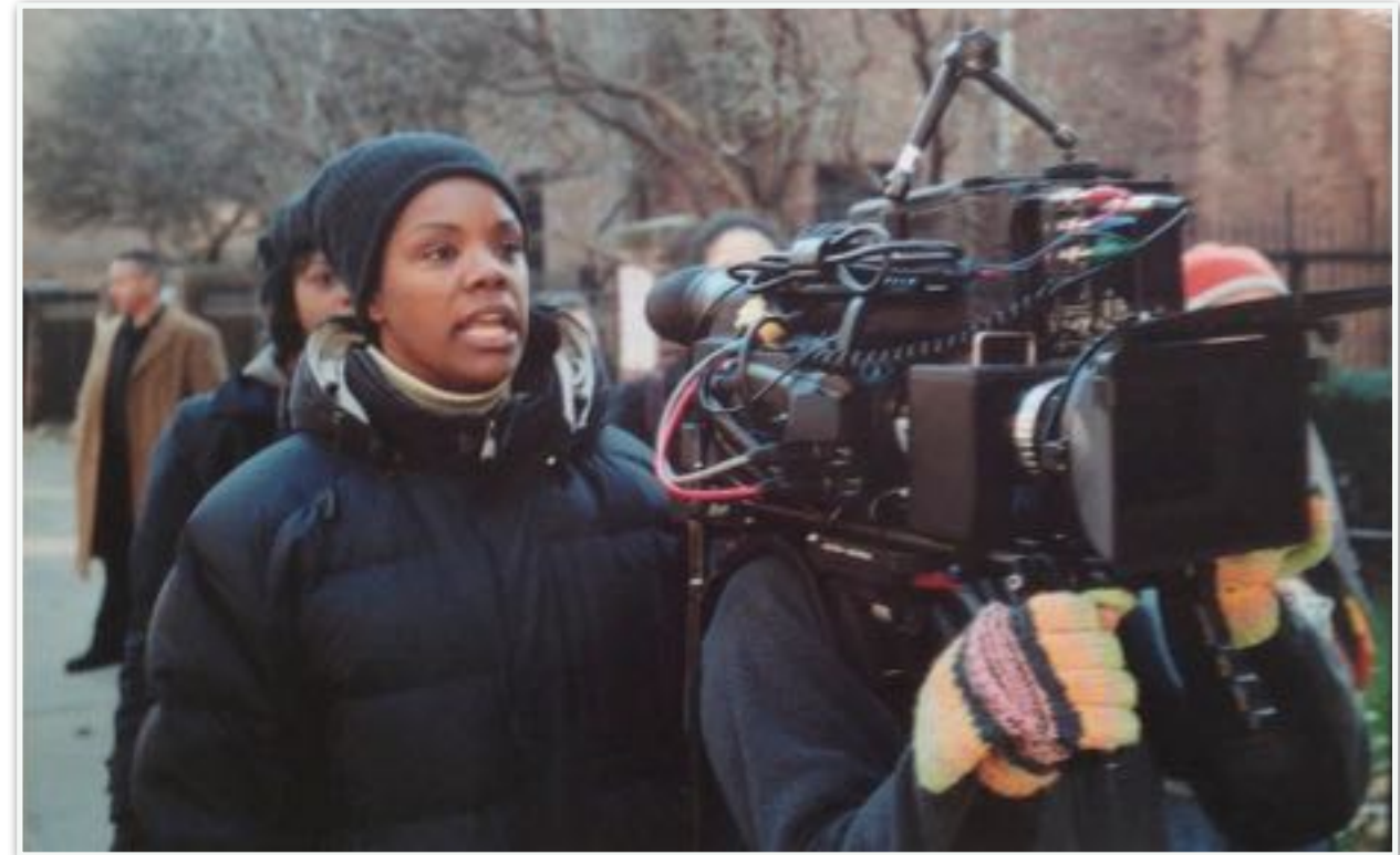
Directing in Brooklyn.