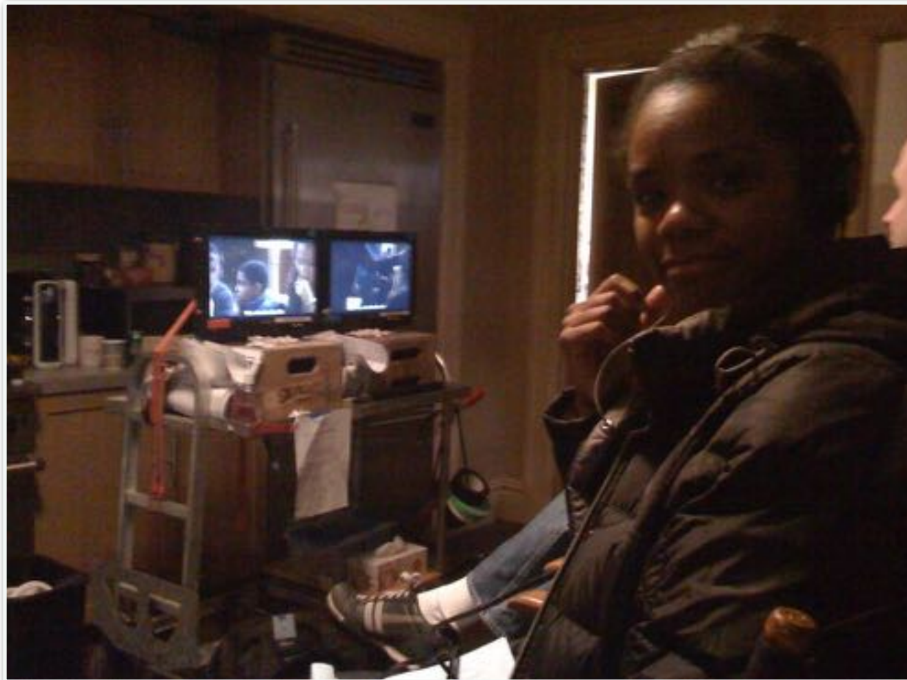
Coaching at HBO